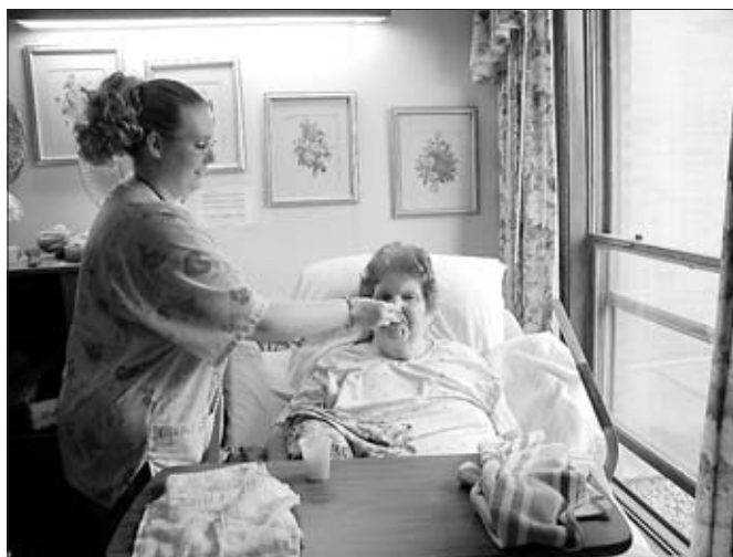
Inspection teams must observe how nursing home staff administer medication to residents.

Some of the instances where we thought that inspectors should have issued a level “G” or higher deficiency involved two or more deficiencies that were at least partially cross-referenced to one another. In these cases, inspection teams typically issued one deficiency at level “G” and the other at level “D.” According to the State Operations Manual (SOM) though, if the team’s findings for a particular requirement include examples at various severity or scope levels, the deficiency should be classified at the highest level of severity, even if most of the evidence corresponds to a lower level of severity. 14 For example, in one facility a newly admitted resident, previously hospitalized for knee surgery, had to wait two hours before receiving pain medication. The nursing staff could not find the medication the resident had been receiving in its emergency kit and staff had to “borrow” medication from another resident. The facility received a “G” level deficiency for not providing services necessary to attain a resident’s highest practicable well being and a “D” level deficiency for not providing the necessary pharmacy services to meet the resident’s emergency needs.