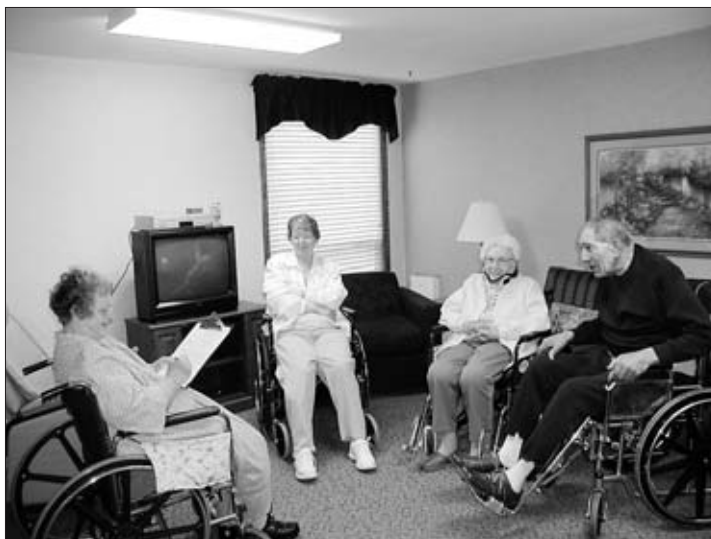
Nursing home inspectors must meet with each facility's resident council.

For the year ending September 30, 2004, MDH inspectors, working in teams of three to five registered nurses, spent an average of about 150 hours per facility to complete the state and federally mandated inspection tasks. 12 As would be expected, it took longer to inspect larger nursing homes than smaller ones. For example, a facility with 40 or fewer beds averaged about 72 hours per inspection while a facility with 116 to 160 beds averaged 176 hours. 13