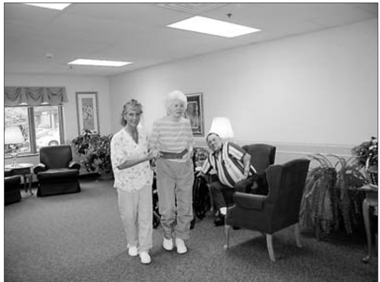
Nursing home residents generally need help with many activities of daily living.

The federal government and states share responsibility for ensuring that nursing homes provide an acceptable level of care to residents. The Centers for Medicare and Medicaid Services (CMS) in the U. S. Department of Health and Human Services oversees the inspection program for nursing homes that participate in the