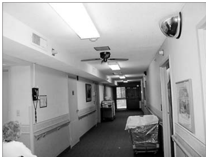
To help prevent accidents, nursing homes must keep corridors free from obstructions.

In a few cases, inspection teams cited the wrong regulation in writing the inspection report, used the same incident to issue two mutually-exclusive deficiencies, or made some other error in completing the inspection report. For example, an inspection team cited one facility for placing a wet food processor lid under a plastic cover and for having a number of baking sheets and