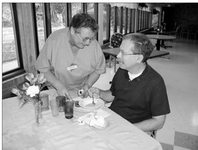
Nursing homes must provide services to residents in a dignified manner.