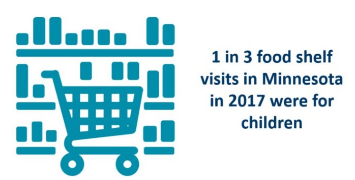
Figure 1. Minnesota Food Charter Facts & Statistics, Hunger Solutions 2017 Report