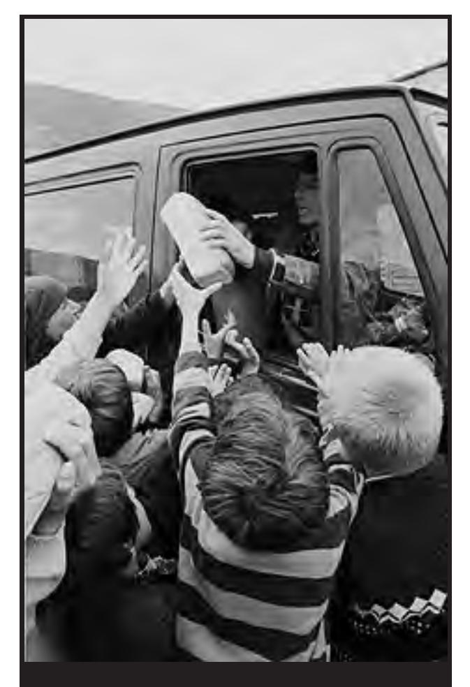
Remember that refugee children will have the same levels of fear and anxiety encountered in U.S. children of the same ages.

During the exam, providers should be considerate of refugees' cultural and religious beliefs and accommodate them as much as possible. For example, an Islamic woman may not wish to be examined by a male physician. If using interpreters, bear in mind that the gender of the interpreter should similarly be