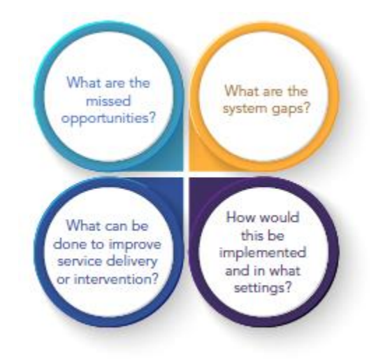
Figure 1. Questions to ask OFR team during problem-solving process to identify recommendations